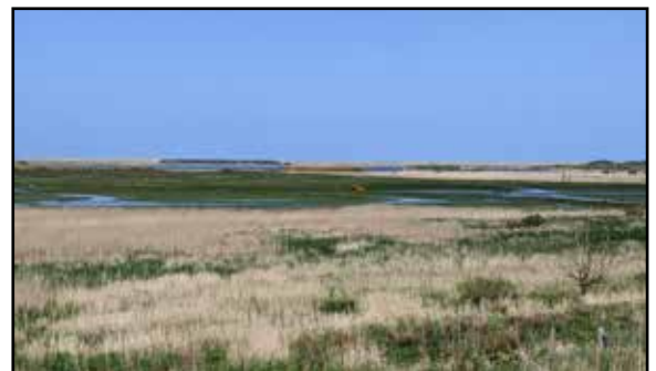
Loch of Strathbeg