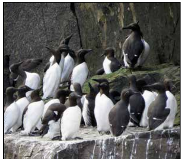
Guillemots (Common Murre)