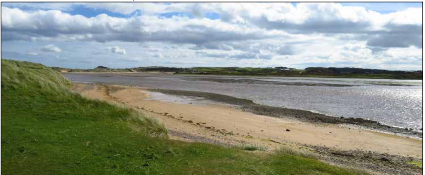
Sands of Forvie and Ythan Estuary