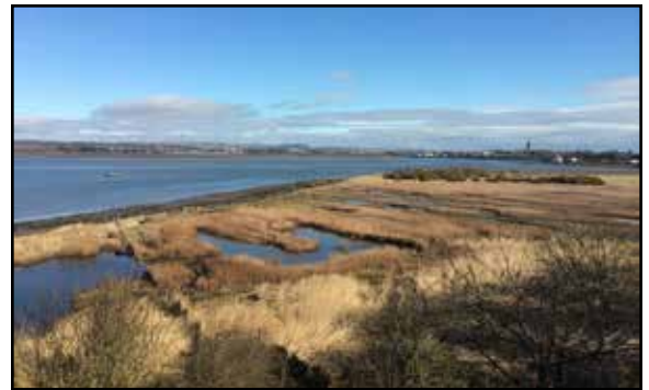
Loch of Strathbeg