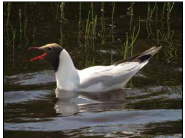
Black-headed Gull at Loch Leven